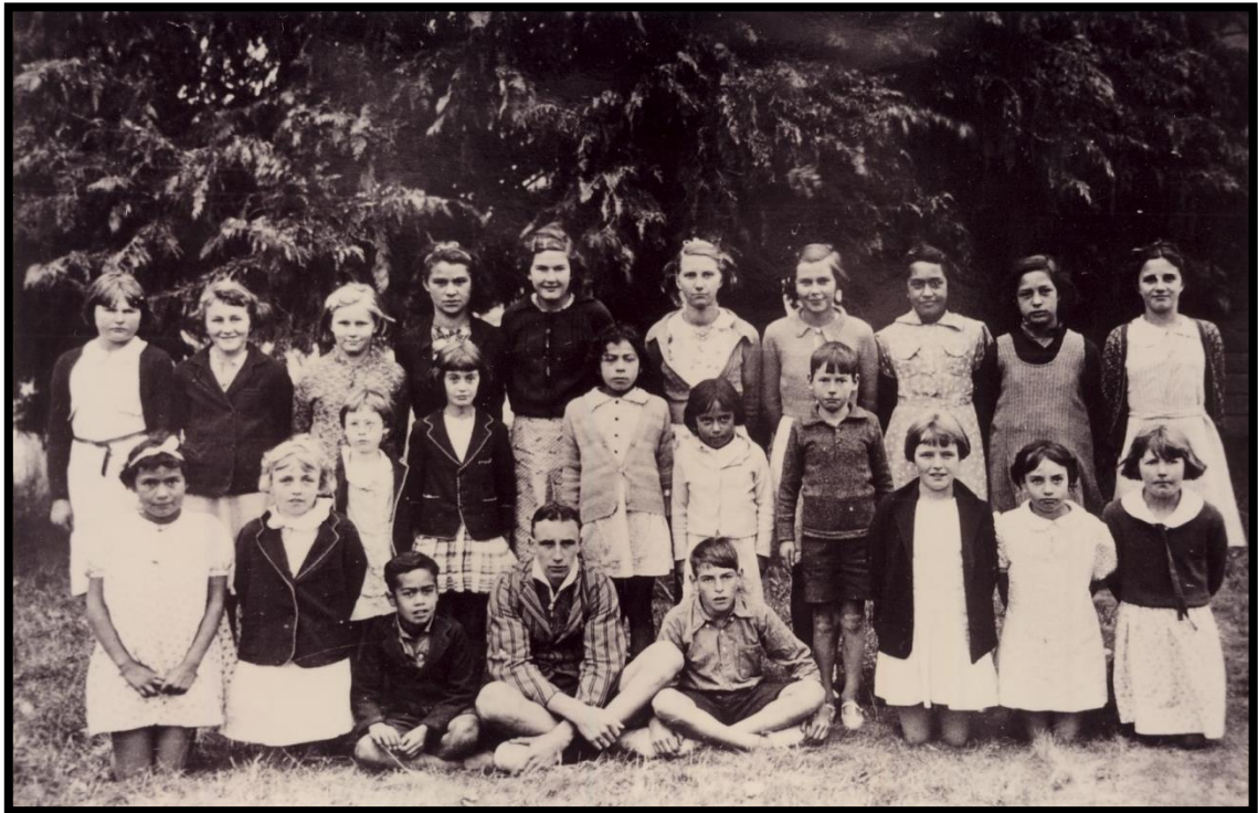
Canvastown School 1930's