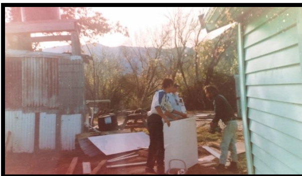
Below: Whānau working at Te Hora in the mid 1990's