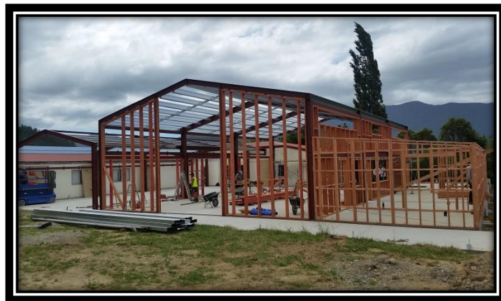
Above: The current wharekai development which is well under way

Te Hora Marae remains closed until approximately April 2015.